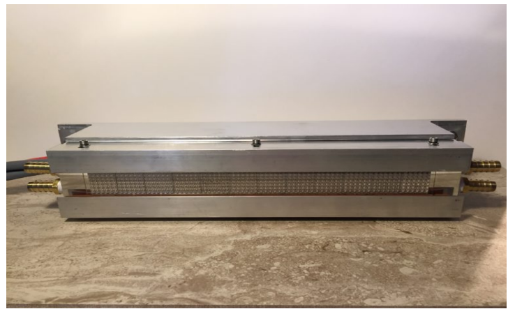
Twinhead or single array options available – combine any wavelengths of LEDs