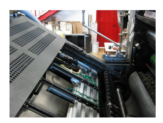
Offset delivery UV

101 North Harrison St. Palmyra, Pennsylvania 17078 USA Phone: +1 (717) 838-7220 Email: info@aradiant.net www.aradiant.net Joe Burgio Cell: +1 (717) 507-4297